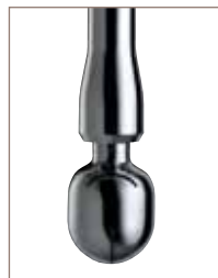
Toftejorg SaniMidget • Full coverage • Effective cleaning at low flow rate • Sanitary design