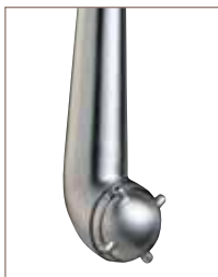
Toftejorg SaniJet 20 • Totally self cleaning • Follows EHEDG guidelines • FDA compliant • High-impact cleaning

The complete coverage, rotary action and impact afforded by rotary jet heads makes them particularly effective in cleaning viscous, foaming or thixotropic products of the type commonly produced in the personal care industry. The efficient removal of such residue also grants significant savings in terms of time and water consumption.