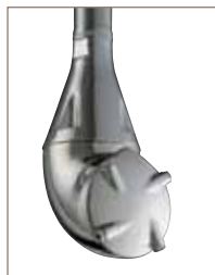
Toftejorg TJ 20G • 360° impact cleaning and coverage • Award-winning hygienic design