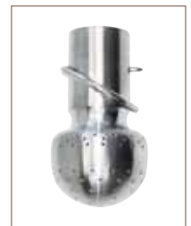
8000 Series Spray Balls • 3A compliant • Custom options including laser drilling • A variety of surface finishes including EP