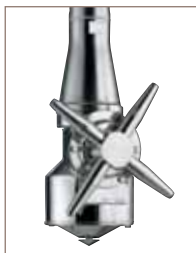
Toftejorg TZ-74 • 360° impact cleaning and coverage • Effective cleaning at low flow rate