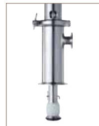
Toftejorg SaniMidget Retractor • Retractable • Suited to tanks with internal components • Self cleaning and self draining